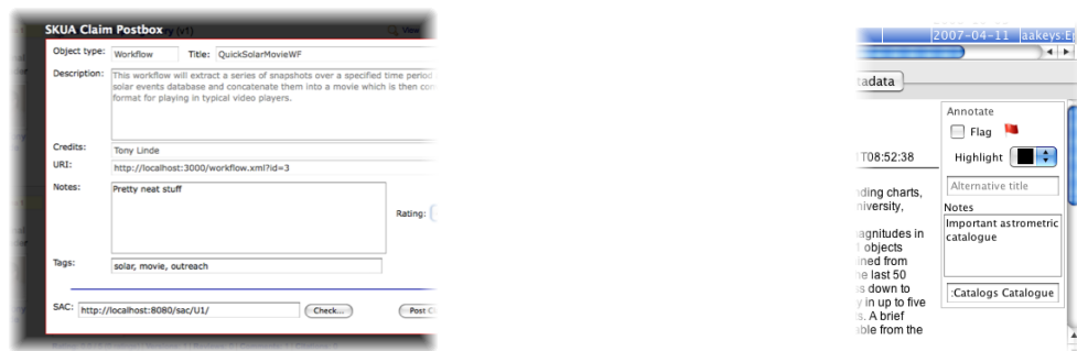
Figure 2: Annotation panels for Spacebook (left) and VOExplorer (right)